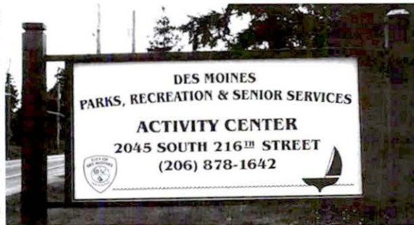
New Activity Center Opened March 24

and other City officials, the ceremony will include welcoming remarks, recognition of the project architect and general contractors, thanks to the many businesses who made donations, and thanks to the many City departments involved. Following the