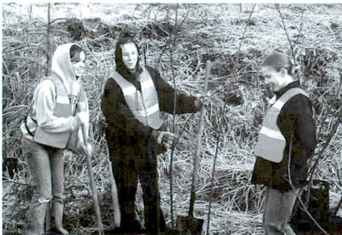
Local students assist in Massey Creek clean up.

Nearly 80 students from Mount Rainier High School and 15 from the District's Waskowitz Environmental Leadership Semester Program worked on two separate days to remove invasive species and plant nearly 300 trees and plants. Students removed nearly three dump truck loads of trash and invasive weeds. They dug out Hi-