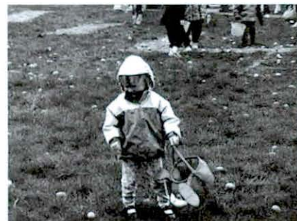
Egg Hunt April 19 at Beach Park

We'll take care of your children and give them lots of fun things to do—a fabulous field trip, swimming, arts and crafts projects, group games and activities, morning and afternoon snacks and much more! Sign up for the week, or by the day! Camp is open to K-6 th grade, April 7-11 (Federal Way School District) and April 14-18 (Highline School District), 7:00 a.m.-6:00 p.m. at the Des Moines Field House, 1000 South 220th Street. Cost is $129 for the week or $29 per day.